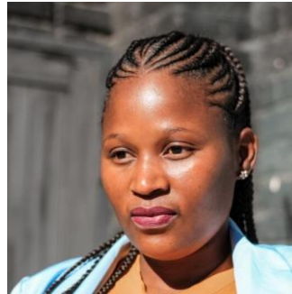
Makeneuoe Fako Bacha re Bacha Youth Forum Lesotho