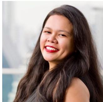
RD Marte APCASO Thailand