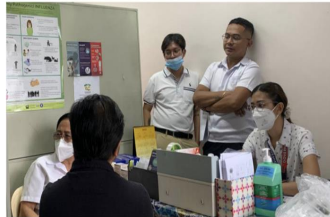
Project 7 SHC