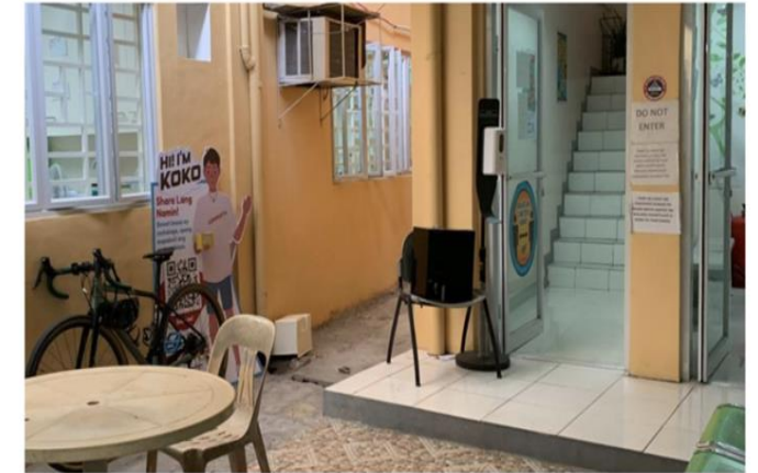
Klinika Project 7